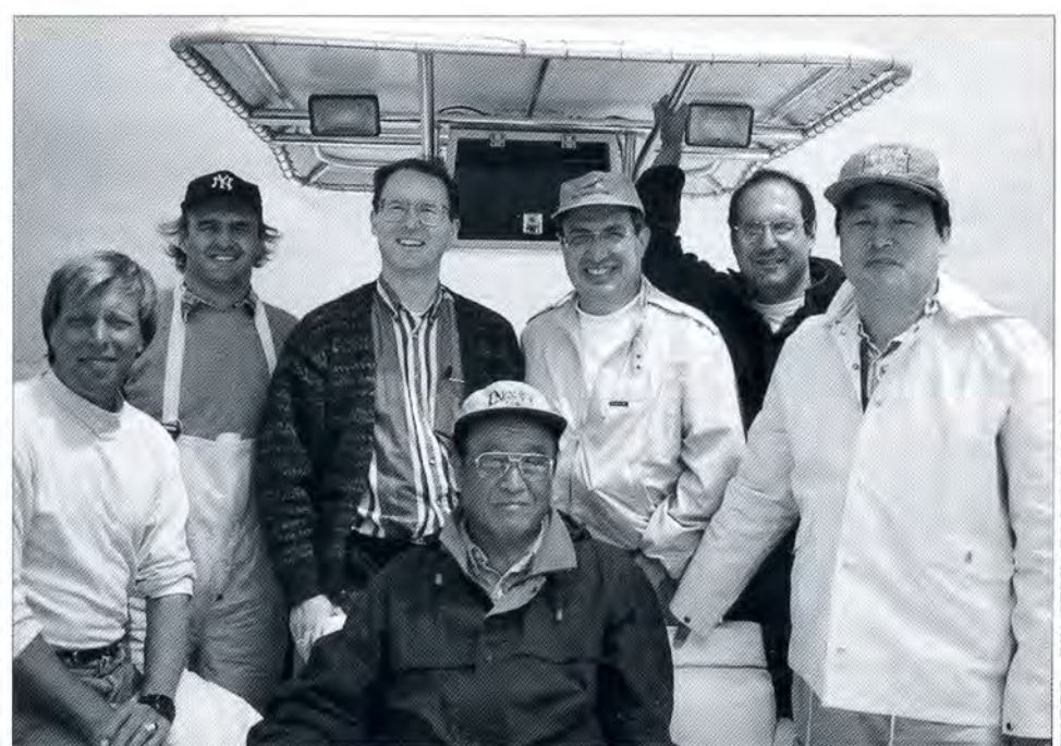
Father poses for a picture while fishing with the lawyers.