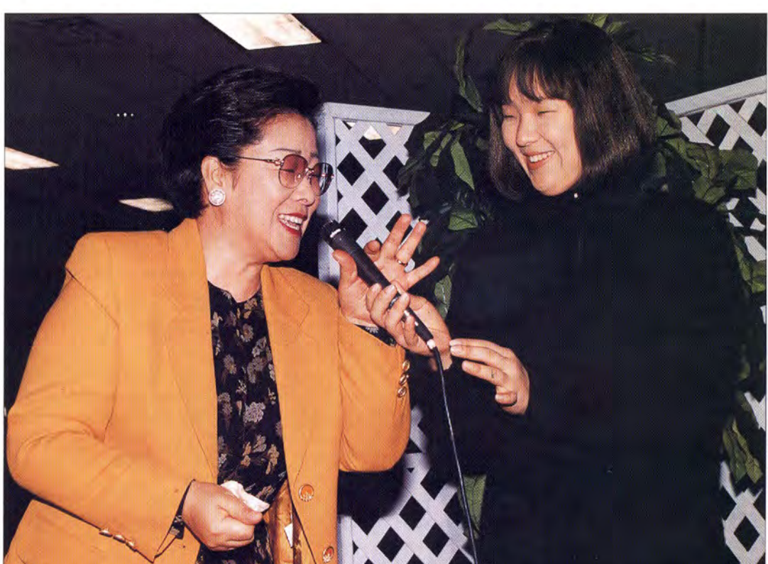
Mother and Sun Jin Nim share the victory of the speech in Philadelphia.

What is next? We should restore God's family and God's country. The responsibility of blessed families is to visit village by village in the satanic world day and night, shedding blood, sweat and tears until not one person remains in the satanic