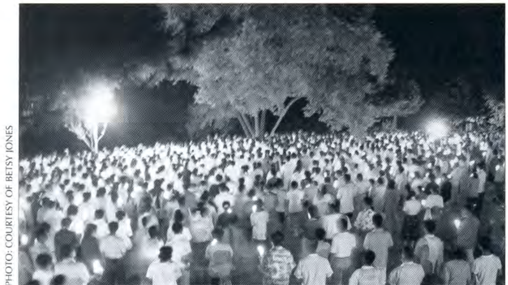
National Messiah candidates praying before the Tree of Heart.