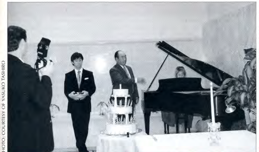
The grand opening of the new East Garden building on July 26, 1987. Father is holy salting one of the two newly purchased Steinway Grand pianos.

Heung Boo and Nol Boo, a story about Cain and Abel type brothers. My background in the "Equal Interval System" helped me to write music depicting monsters, terror, joy or whatever other expression was needed for the script.