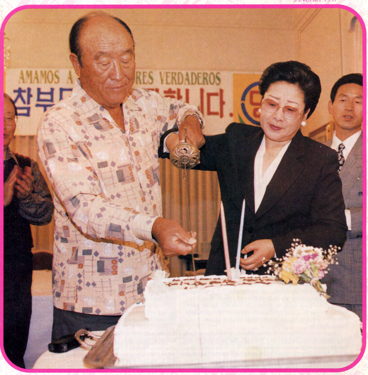
FATHER—RESPONSIBILITIES GIVEN TO THE BLESSED CHILDREN MOTHER—GUIDANCE TO MEMBERS IN LATIN AMERICA