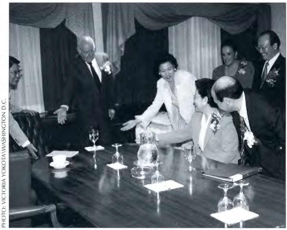
Former president of Costa Rica offers Mother to sit at the head of the table.